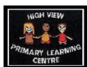
High View Primary Learning Centre